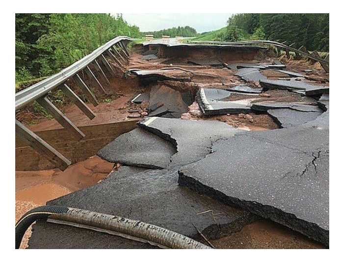
Figure 5. Damage along State Highway 23 near the South Fork of the Nemadji River in Carlton County, Minn., after flash flooding.