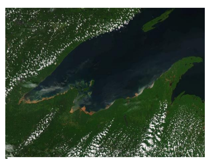
Figure 3. Sediment showing on the south shore of Lake Superior after heavy rain June 15-17, 2018