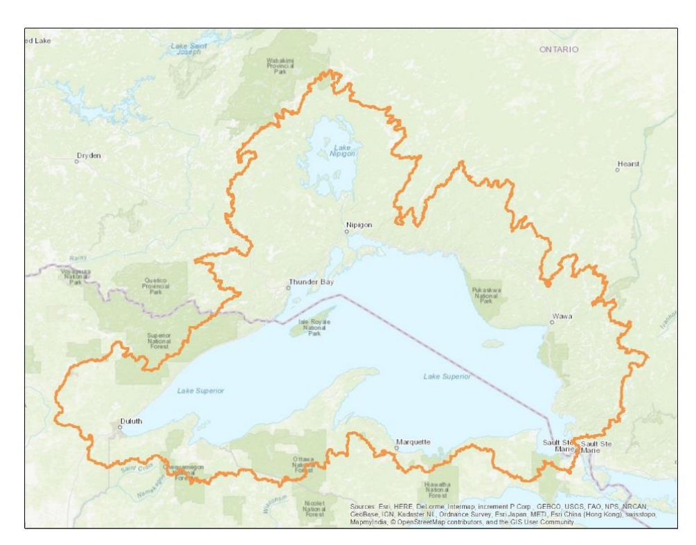
Figure 1 Lake Superior Watershed.

The Lake Superior Basin in Minnesota encompasses portions of Aitkin, Carlton, Cook, Itasca, Lake, Pine and St. Louis Counties, covering approximately 6,200 square miles. Major watersheds in the basin include the Cloquet, Nemadji and St. Louis River systems, as well as the North Shore tributaries to Lake Superior.