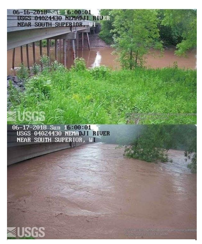
Figure 4. This pair of images, provided by the U.S. Geological Survey by way of the National Weather Service shows the Nimadi River, on the afternoon of June 16<sup>th</sup> (top) and then amid flash flooding the afternoon of June 17<sup>th</sup> (bottom) after heavy rain fell in the region.

Superior, Wis., reached its highest level on record, the National Weather Service reported. The rising water forced the closure of highways 2 and 53 at the river crossing on the east side of Superior.